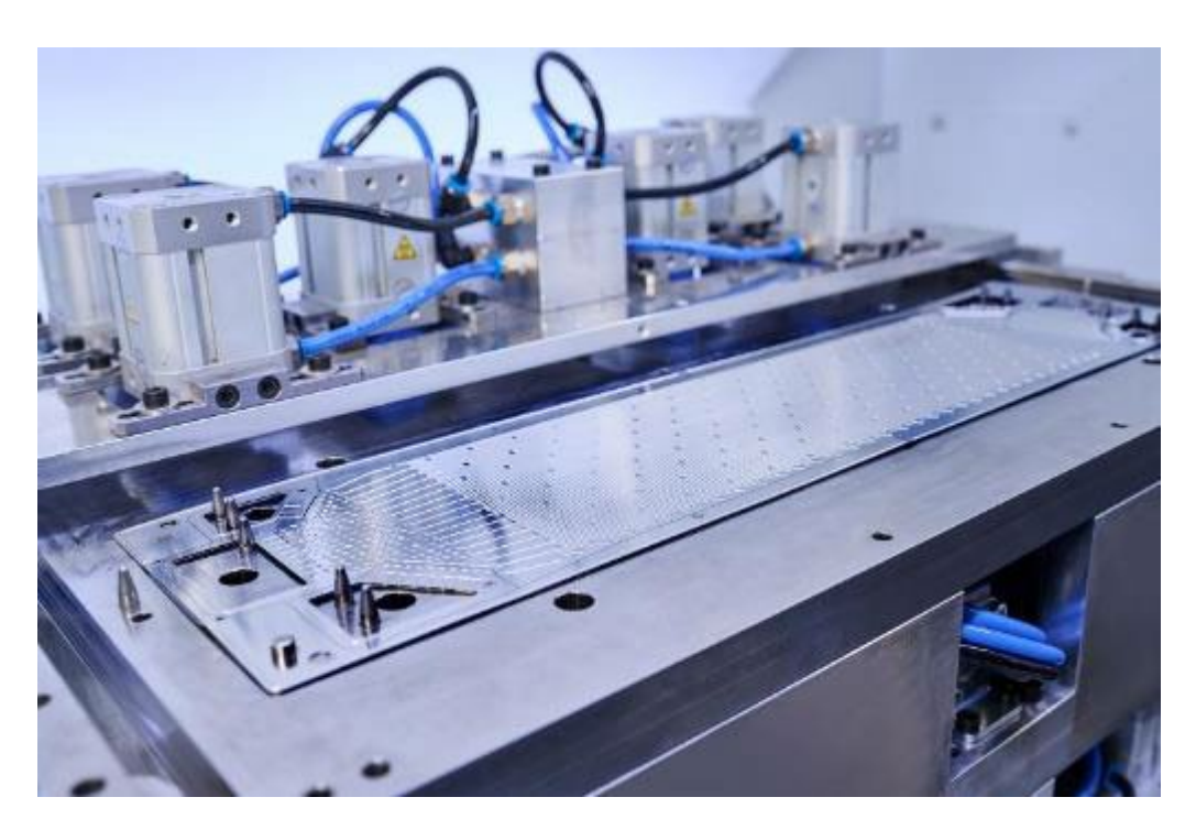
Metallic bipolar plates are a key element of fuel cell stacks.