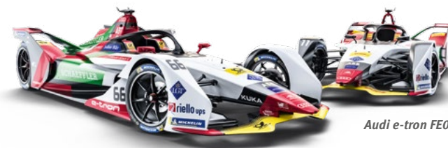
Audi e-tron FE05

Point system 1 25 pts. 2 18 pts. 3 15 pts. 4 12 pts. 5 10 pts. 6 8 pts. 7 6 pts. 8 4 pts. 9 2 pts. 10 1 pt.