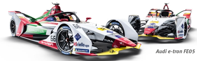
Audi e-tron FE05

Point system 1 25 pts. 2 18 pts. 3 15 pts. 4 12 pts. 5 10 pts. 6 8 pts. 7 6 pts. 8 4 pts. 9 2 pts. 10 1 pt.