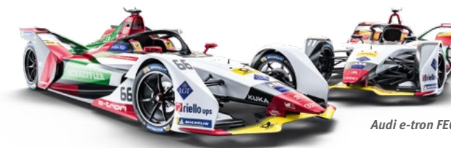
Audi e-tron FE05

Point system 1 25 pts. 2 18 pts. 3 15 pts. 4 12 pts. 5 10 pts. 6 8 pts. 7 6 pts. 8 4 pts. 9 2 pts. 10 1 pt.