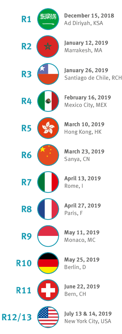
ABB FORMULA-E FORMULA-E CHAMPIONSHIP