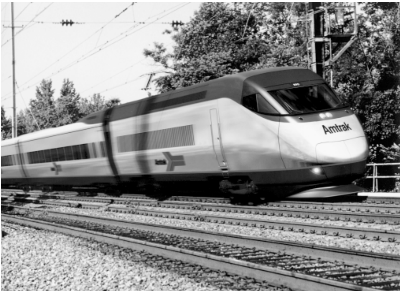
American Flyer: New development by the consortium of Bombardier Transportation (Canada) and ALSTOM (France)

American Flyer - that is the name of the new American high-speed trains which are designed to close the gap in the high-speed sector still existing in comparison with Europe (TGV, ICE) and Japan (Shinkansen). The trains, operated by AMTRAK, are scheduled to provide regular rail