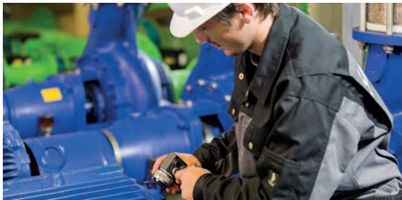
Use of the measurement system on, for example, motor, pump, fan