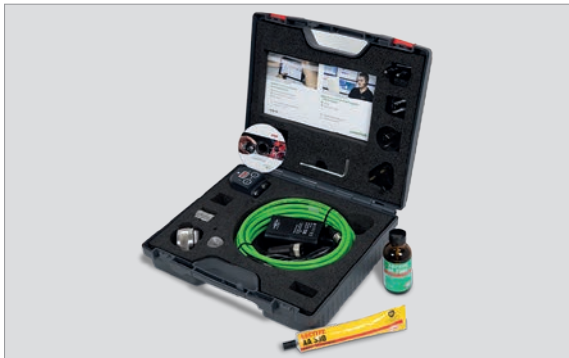
FAG SmartCheck Service Kit