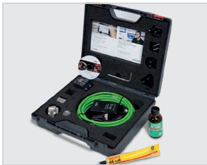
FAG SmartCheck Service Kit