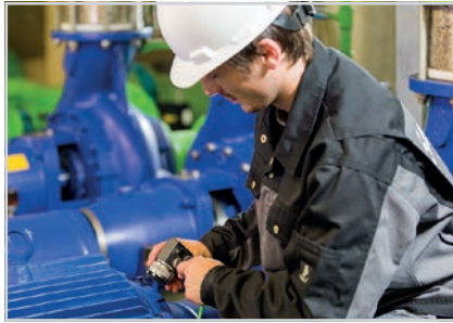
Use of the measurement system on, for example, motor, pump, fan