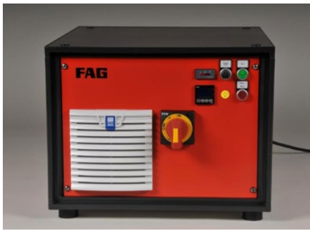
FAG medium frequency generator – compact design, giving the additional option of mobile use