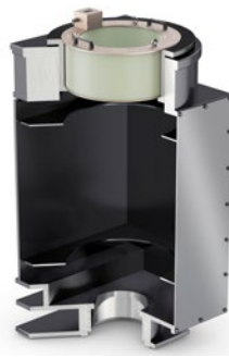
Housing in vertical position with fixed inductor for heating of the bearing seat