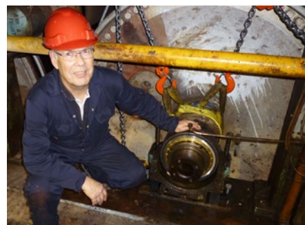
Mounting work at dryer roll