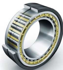
FAG self aligning cylindrical roller bearing (SACR)