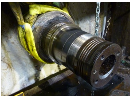
Shaft ready for bearing mounting