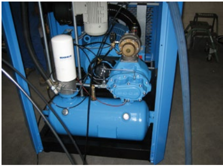
Monitoring of a screw compressor of Boge