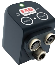
FAG SmartCheck is a cost-effective, innovative online measuring system