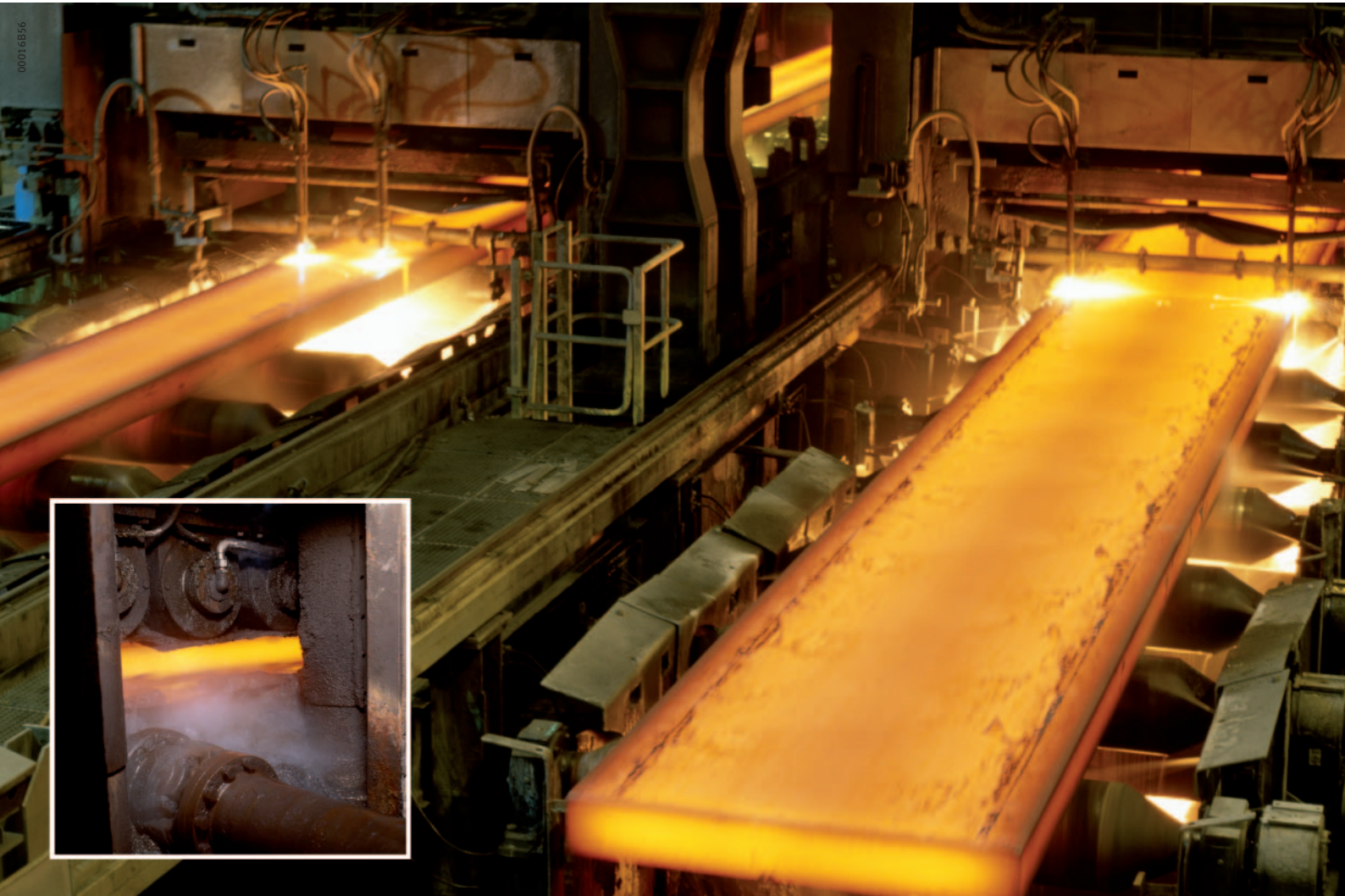
Figure 1 · Guide rolls in continuous casting plant CGM 22