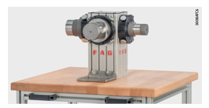
Figure 9 Training equipment: Mounting cross

The mounting cross is of a modular structure and can be supplemented and expanded by a large number of different exercises. The initial configuration contains the basic tools required, the mounting cross itself and four different exercises on the most frequently used bearing types. Each one of the exercises contains the bearings, adjacent parts and tools required. Mechanical, thermal and hydraulic methods are communicated.