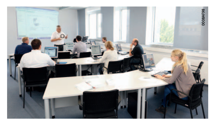
Figure 5 Training course at the Eltmann site

Training courses on mounting and dismounting generally comprise a theoretical part and a practical part. Thorough knowledge is communicated, for example, on the mounting and dismounting of rolling bearings using the optimum tools and on the condition monitoring of bearing arrangements, especially through the use of noise, vibration and torque measurements.