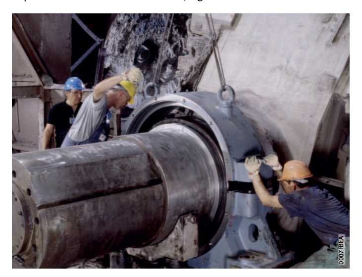
Figure 1 Mounting service provided by Schaeffler experts

Mounting and dismounting The Schaeffler Industrial Service experts offer mounting and dismounting services for rolling bearings that are applicable across industrial sectors. They have detailed knowledge and extensive experience in all industrial sectors, Figure 1 .