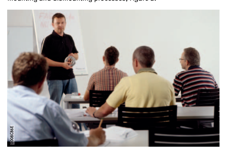
Figure 2 Theoretical training

Here, information on the correct handling of rolling bearings and the avoidance of mounting errors is imparted by our rolling bearing experts. This is carried out with direct reference to the specific application and the individual circumstances of the customer.