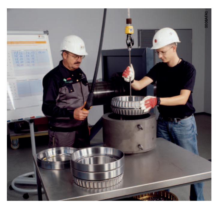
Figure 6 Training course on mounting of rolling bearings

Several training modules cover the mounting and dismounting of rolling bearings and linear guidance systems. Based on perception and exercises, the participant gains the mounting knowledge and skills that he will require in practice. Our training courses on mounting cover a large number of applications. Mounting exercises on individual products are followed by work on more complex systems such as gearboxes, rail wheelsets or machine tools. The possibilities for plannable and economical design of maintenance work on machines, plant and rolling bearings are communicated to the training participant in appropriate courses.