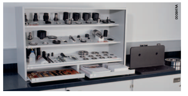
Figure 7 Basic course: Mounting cabinet

Literature on the correct mounting of bearings is readily available, however there is a general lack of appropriate equipment on which apprentices can practise in as practical a sense as possible. The trainers from the Schaeffler training workshops therefore compiled a basic course, Figure 7 .