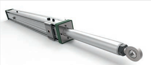
Heavy duty actuator