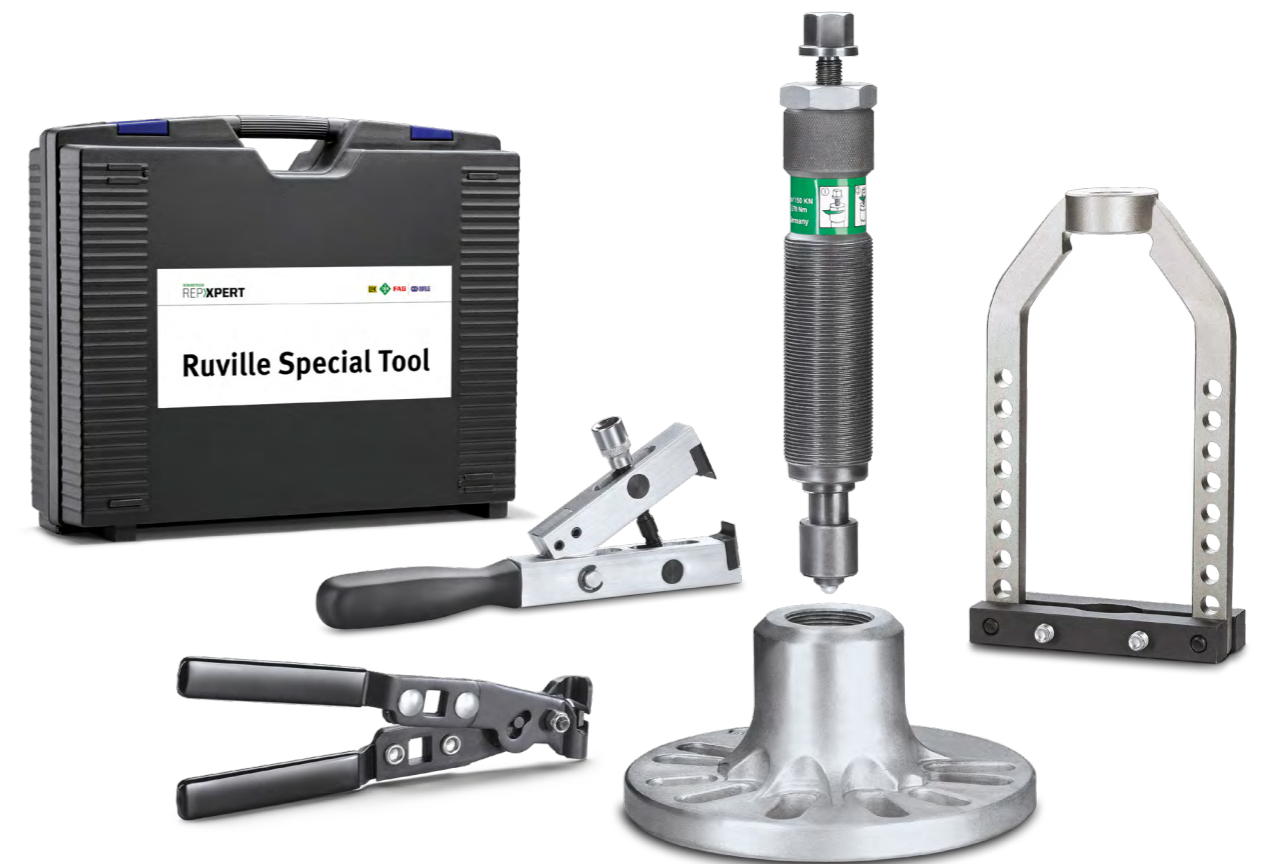
Part number: 1002290