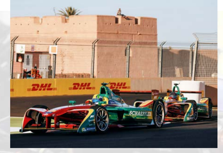
Top team performance ABT Schaeffler Audi Sport is in contention for victory