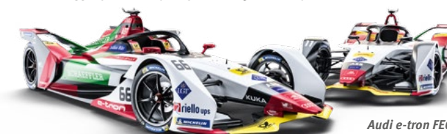
Audi e-tron FE05

Point system 1 25 pts. 2 18 pts. 3 15 pts. 4 12 pts. 5 10 pts. 6 8 pts. 7 6 pts. 8 4 pts. 9 2 pts. 10 1 pt.