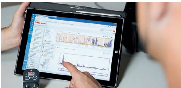
Data analysis with FAG SmartWeb