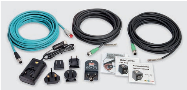
FAG SmartCheck starter kit