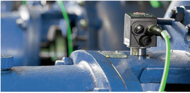
FAG SmartCheck in use on a pump