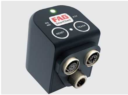
FAG SmartCheck – small and robust