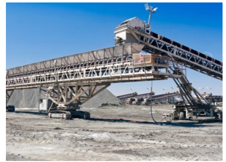
A downtime on the conveyor belt causes high costs