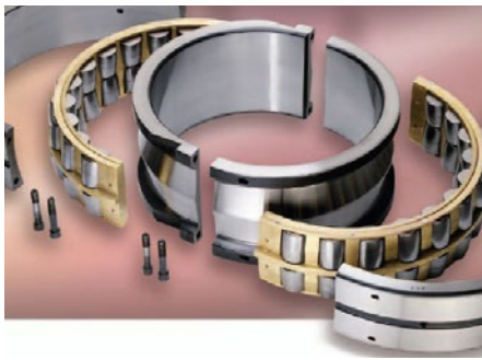
FAG split spherical roller bearing