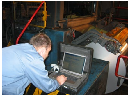
Schaeffler experts support installation of the measuring system