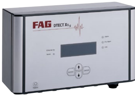
Vibration diagnosis with FAG DTECT X1s (follow-up product of FAG DTECT X1)